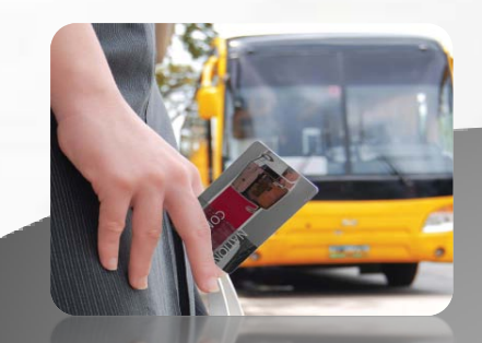
Automatic Fare Collection