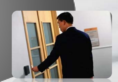
Physical Access Control